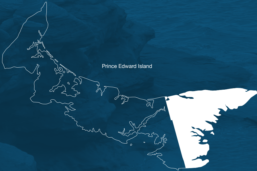
Prince Edward Island